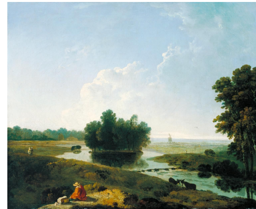
Richard Wilson, Hounslow Heath, 1770

These are two images I found for Hounslow Heath. The first is of a Richard Wilson painting; showing the endless greenery of the area in the 1700's. The second is a historical impression of the Heath when it was known as England's 'wild west', where highwaymen ruled the area.